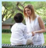
Loving Foster Parents