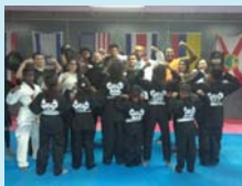
Weekly Karate Instruction